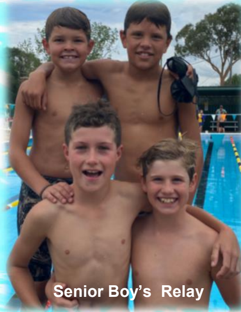
Senior Boy's Relay