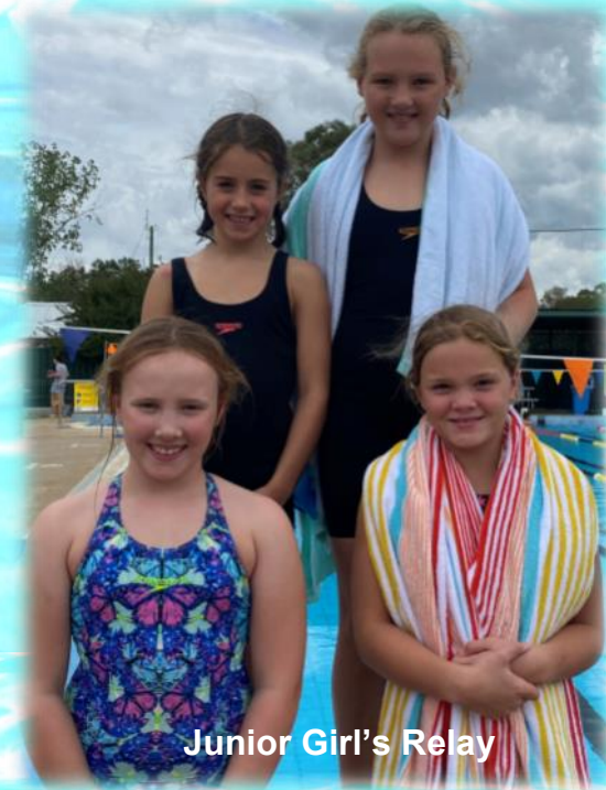
Junior Girl's Relay