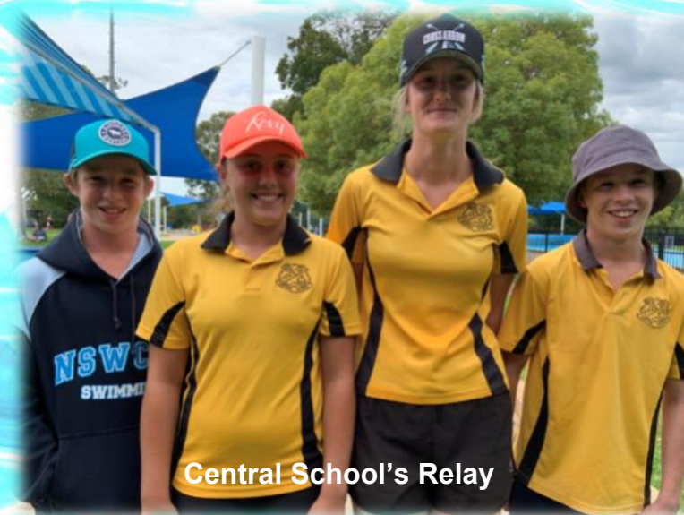
Central School's Relay