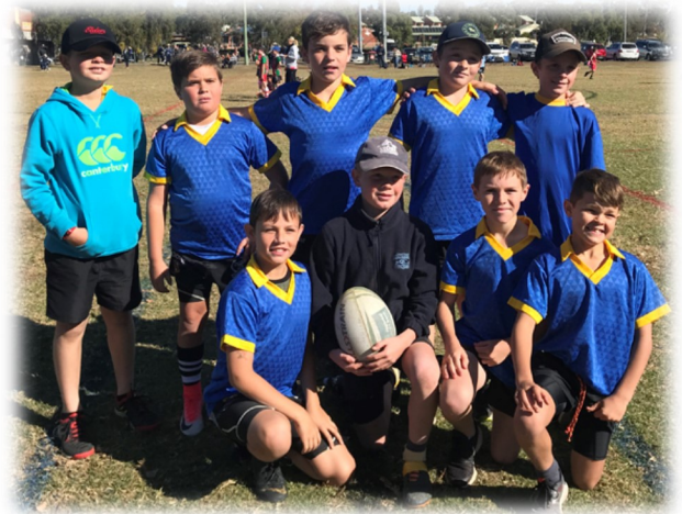
North West Primary Touch Football Team