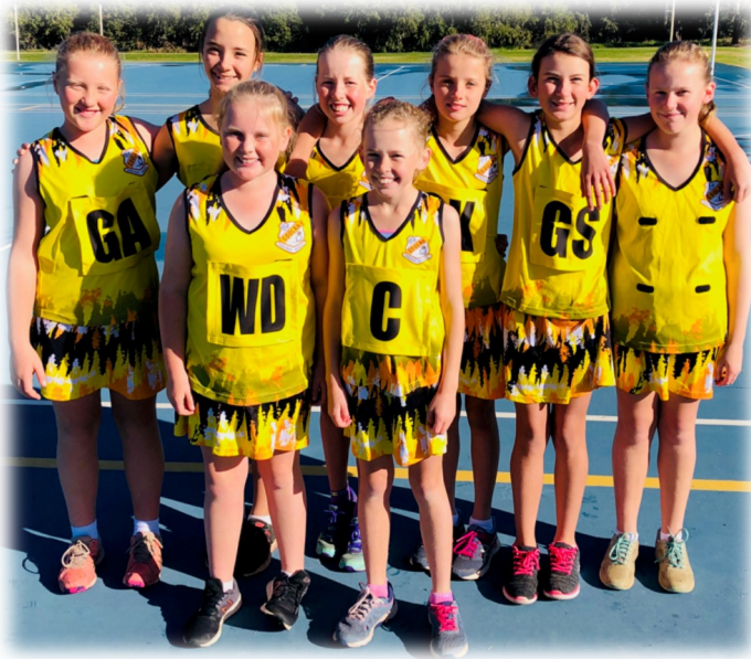
CCS Schools Netball Cup Team

Excursion notes for the Year 5 and 6 Canberra excursion have been handed out, notes for the Year 3 and 4 excursion to Lake Keepit will be sent home this week. Please take note of the deadlines for these excursions, if financial assistance is needed please do not hesitate to speak with the Principal regarding any help the school can provide. Further information regarding these excursions will be sent home at a later date.