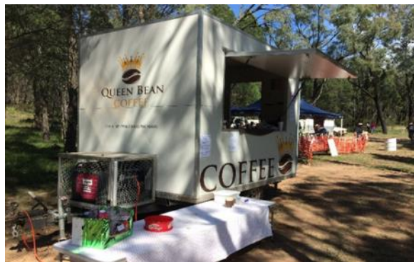
Picture of the Coffee Van at the Hartwood Festival.